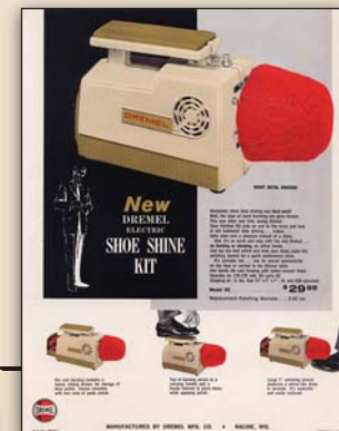
Dremel® Electric Shoe Polisher introduced

Mass-circulation credit cards appear in America.