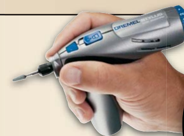
Dremel® Stylus introduced