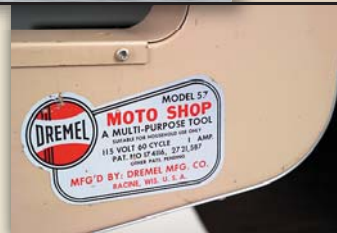
Dremel® Moto-Shop Jig Saw introduced